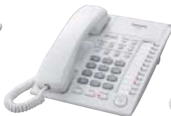
■ KX-T7720 Speakerphone Unit