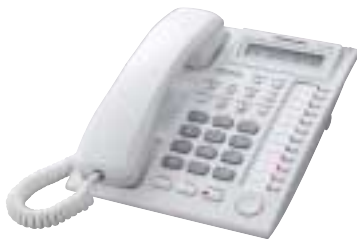
■ KX-T7730 LCD, Speakerphone Unit

* An optional card is required. Please contact your dealer or phone company to confirm if the Caller ID service is available in your area.